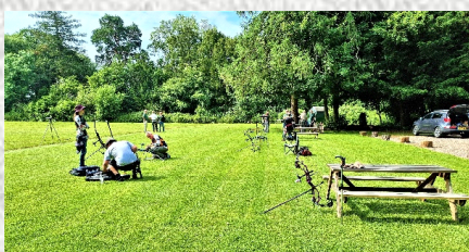
Setting up on the 27 th June