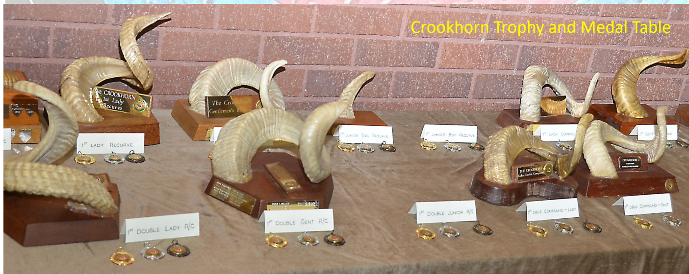
Crookhorn Trophy and Medal Table