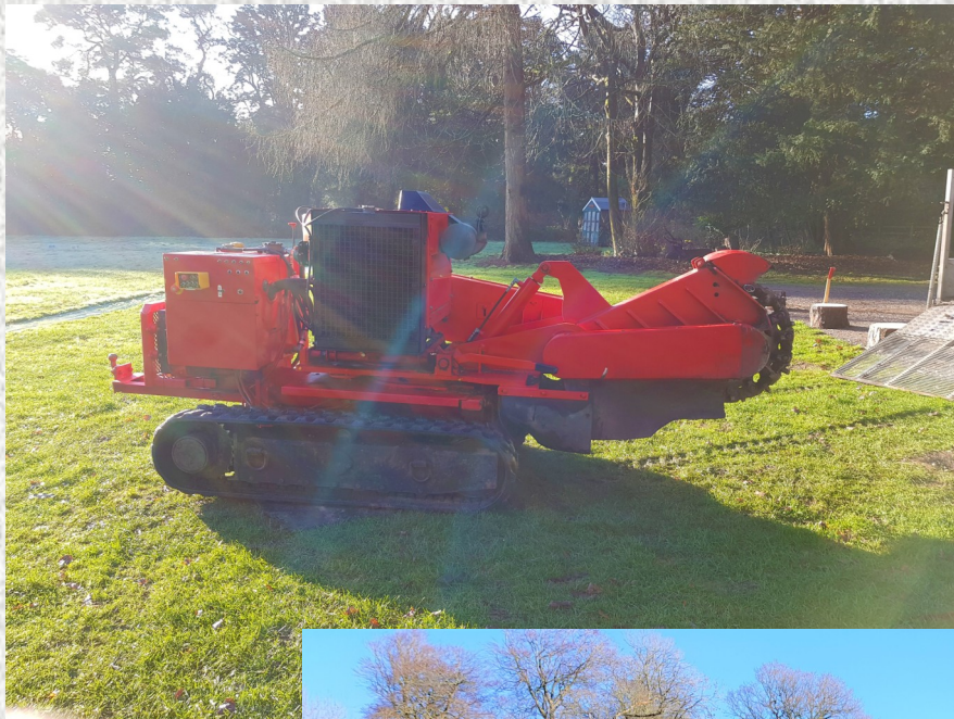
The stump remover.